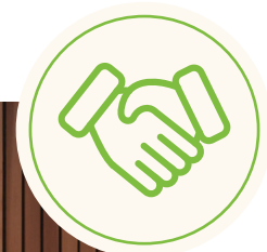
Allegiance set visit with NDP government representatives and Creative BC